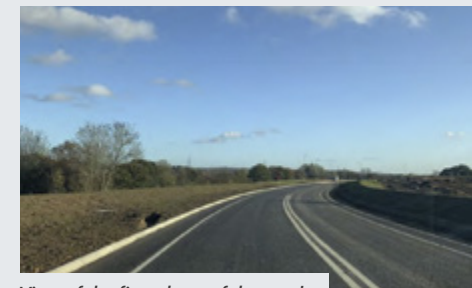
View of the first phase of the newly constructed relief road

Progress is continuing to construct the new relief road around the outskirts of Beaulieu that will ultimately provide a direct route from Junction 19 of the A12, known as the Boreham Interchange, through to Essex Regiment Way (A130). The new relief road, to be known as the A131, will replace Colchester Road and White Hart Lane as the strategic route to Braintree, Stansted Airport and the M11, ultimately relieving congestion in and around Springfield. The new relief road will also provide the access to the proposed Beaulieu station which is scheduled to open in 2025/2026.