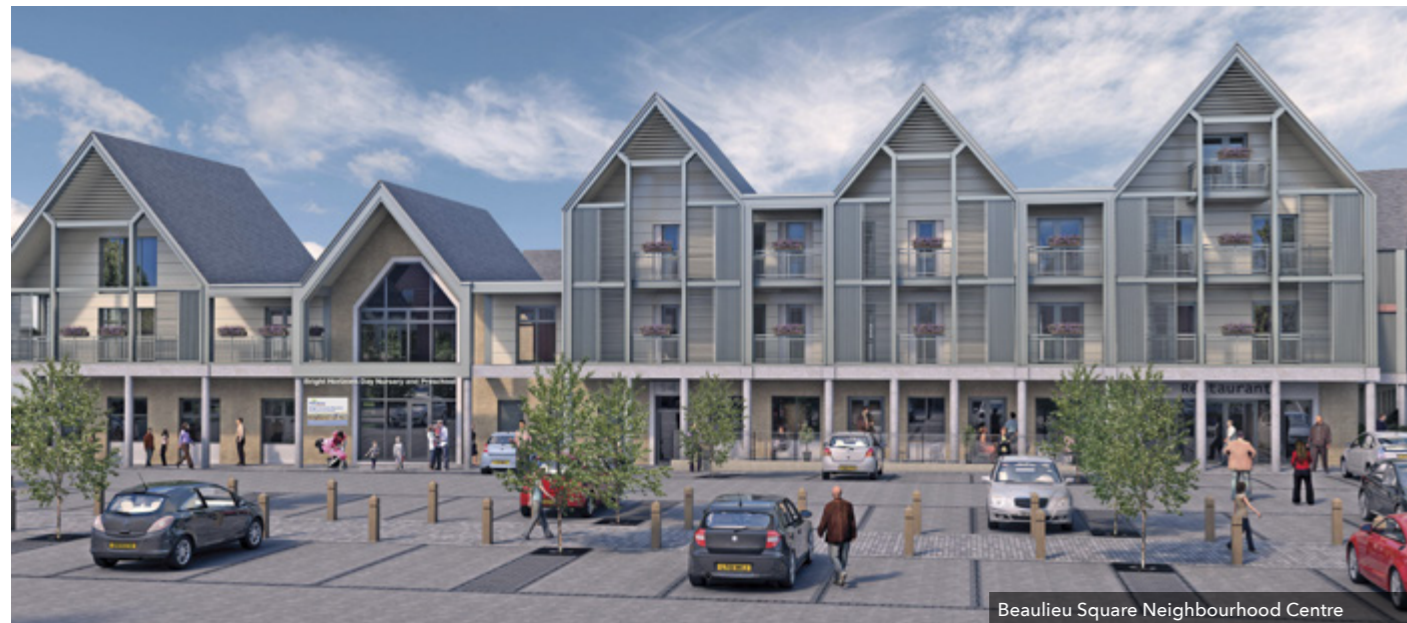
Beaulieu Square Neighbourhood Centre