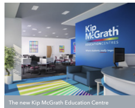
The new Kip McGrath Education Centre

Residents and the wider community will also soon be able to get involved with a wide range of activities and initiatives at the Beaulieu Community Centre, which will also serve as a place of worship. Under the guidance of the Beaulieu Community Trust, the Centre will help to establish a real sense of belonging, allowing both new and existing residents to come together as a community. It will be one of the largest and most accessible spaces available for hire in the local area.