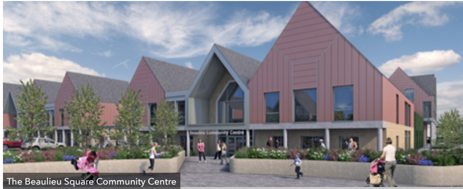
The Beaulieu Square Community Centre